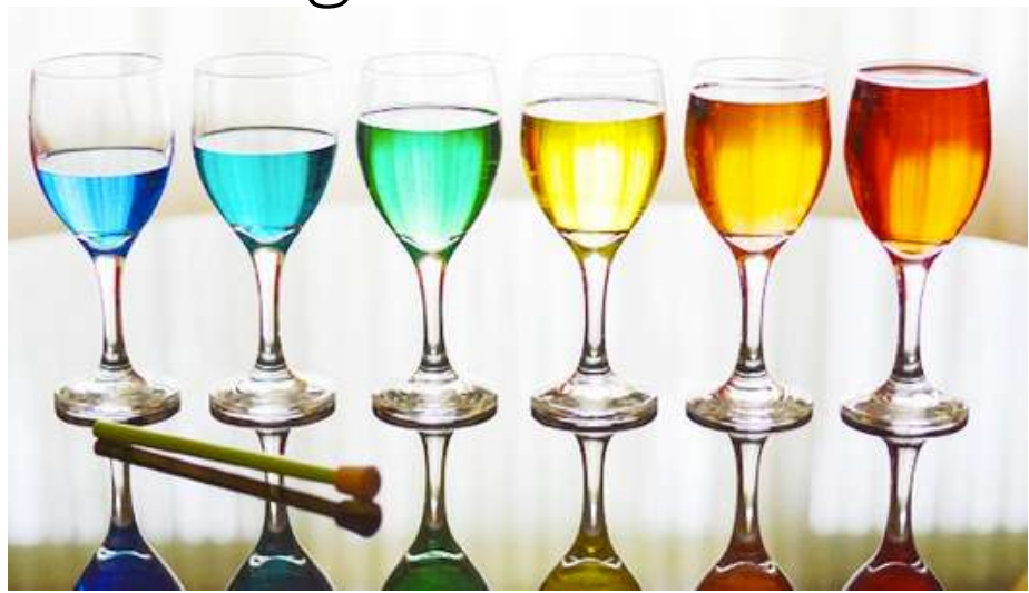
Wine glass "armonica"