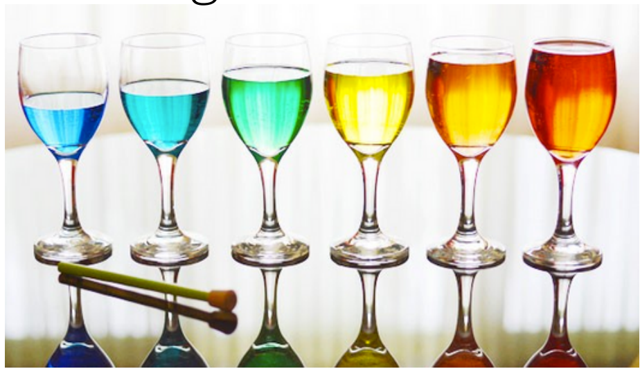
Wine glass "armonica"