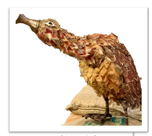
This is Bird.