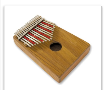
This is a Kalimba.

It is a small instrument played using thumbs.