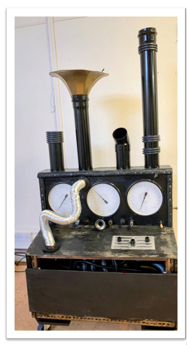
This is what the "Cloud-O-Matic" machine looks like.